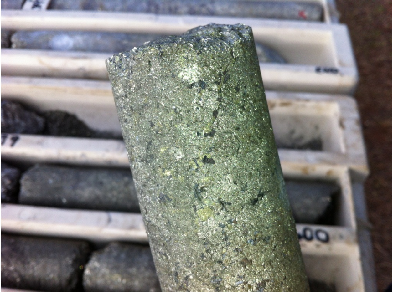
Photograph 1. NQ diamond drill core from hole SPOM023 at about 400m depth showing massive sulphides containing pyrite and chalcopyrite.

A handwritten signature in black ink that reads "K. J. Harvey".