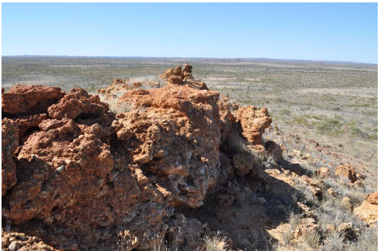
Photograph 2. Wills Phosphate Prospect showing the outcropping leached and brecciated phosphorite horizon (18.3% P_2O_5 ).