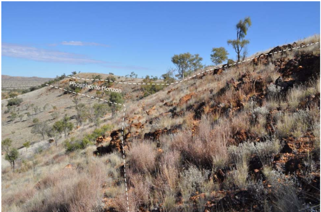
Photograph 1. Wills Phosphate Prospect showing phosphorite horizon.